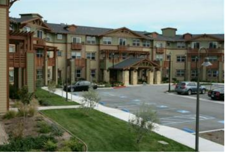
Assisted Living Facility, Village Green, Gilroy