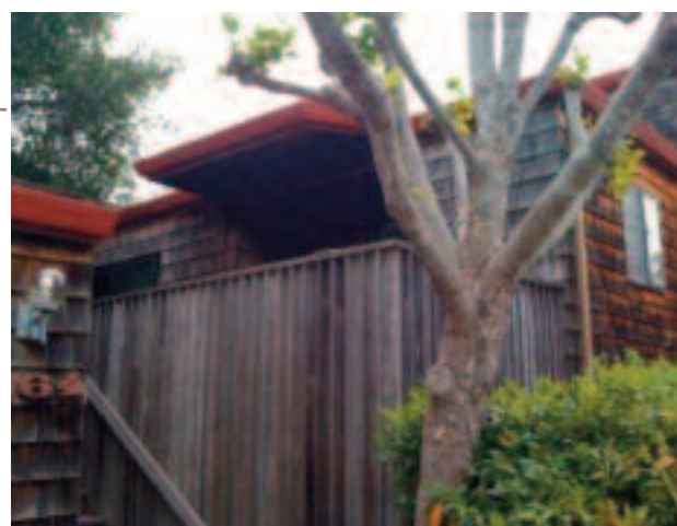
$548,700 - 2BR/2.5BA - 664 Terry St., Monterey, Hillside home with City lights and Monterey Bay views. Unique townhouse offers full kitchen, deck for BBQ & entertaining, great living space w/cozy fireplace, high ceilings, & spiral staircase to 1st floor master suites. W/D, 2-car garage, low-maintenance yard.

State Farm® Providing Insurance and Financial Services Home Office, Bloomington, Illinois 61710