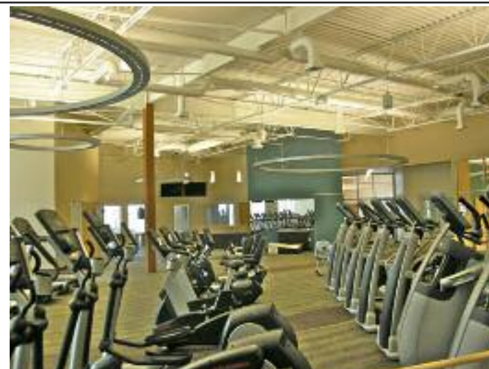
State-of-the-art fitness equipment is available in the cardio area.

ABOUT COMMUNITY HOSPITAL Community Hospital of the Monterey Peninsula, established in 1934, has grown and evolved in direct response to the changing healthcare needs of the people it serves. It is a nonprofit